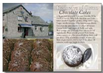
Kennedys Chocolates, Orton, Cumbria