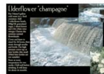
Yorkshire Dales National Park (Elderflower Champagne)