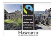
Haworth Fair Trade Village