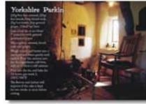
Ryedale Folk Museum, North Yorkshire (Yorkshire Parkin)