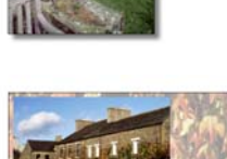
Crooklands Hotel, Kendal, Cumbria