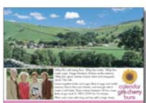
Calendar Girls, Yorkshire Dales promotion