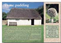
Ryedale Folk Museum, North Yorkshire (Pease Pudding)