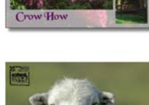
Herdwick sheep, for the Beatrix Potter Gallery (National Trust)