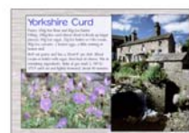
Yorkshire Dales National Park (Yorkshire Curd Tart)