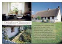
Ryedale Folk Museum, North Yorkshire (Elderflower Champagne)