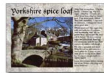
Yorkshire Dales National Park (Yorkshire Spice Loaf)