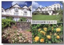
Burnside Hotel, Bowness-on- Windermere, Cumbria