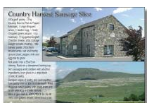
Country Harvest, Ingleton, North Yorkshire