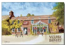
Village Bakery, Melmerby, Cumbria