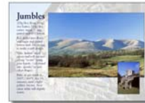
Yorkshire Dales National Park (Jumbles)