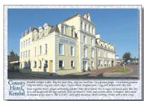
County Hotel, Kendal, Cumbria