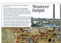
Oswaldtwistle Mill, Oswaldtwistle, Lancashire