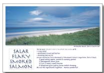
Salar Smoked Salmon, Isle of Uist