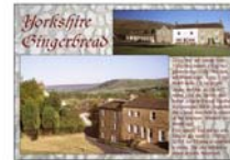
Yorkshire Dales National Park (Yorkshire Gingerbread)