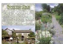
Hill Top, Beatrix Potter's Farm now owned by the National Trust