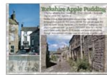
Yorkshire Dales National Park (Yorkshire Apple Pudding)