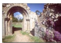
Jervaulx Abbey, Ripon, North Yorkshire